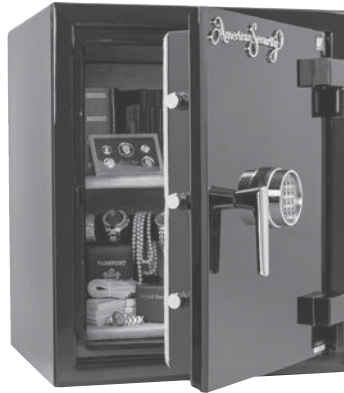
BF2116 IN ONYX HIGH GLOSS WITH ESL10XL