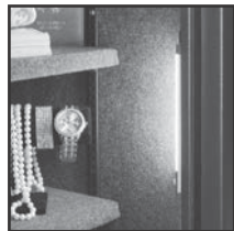
OPTIONAL 8" LED LIGHT KIT WITH MOTION SENSOR AVAILABLE FOR ALL MODELS. SEE PAGE 11 FOR DETAILS.