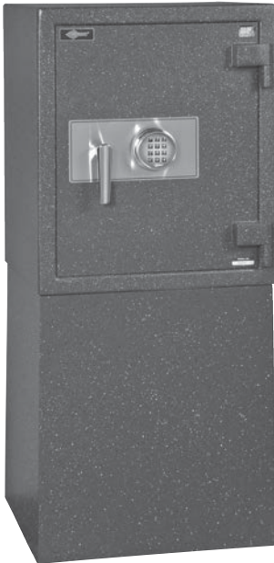
BF2116 W/OPTIONAL PEDESTAL