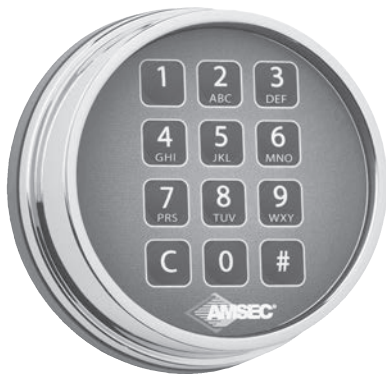
ESL10XL WITH BRASS FINISH