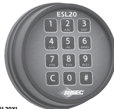
ESL20XL WITH BLACK FINISH

All the ESL20XL features are programmed from the keypad. The Expansion Modules provide convenient screw terminal and slip spade connections for field wiring by the installer. A/C Power can be connected to the ESL10XL and ESL20XL lock (with the ESLAC kit) or an Expansion Module (with the ESLTFMR kit). Wiring, conduit and attachment hardware is provided with all optional kits.