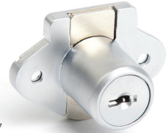
02067 Finish US26D