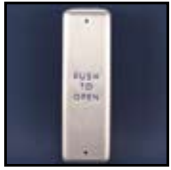
10PBJ - Text only