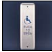
10PBJ1 - Text and Logo