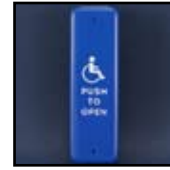
10PBJ1B - Text and Logo Blue