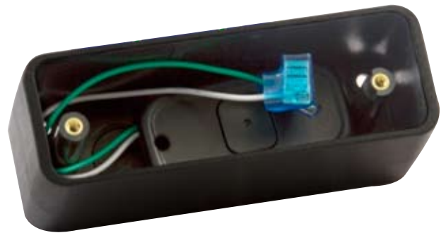
WITH 3-VOLT TRANSMITTER (Sold Separately)