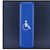
10PBJLB - Logo only Blue