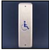
10PBJL - Logo only