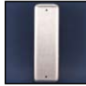
10PBJ10 - Plain