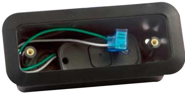
WITH 3-VOLT TRANSMITTER (Sold Separately)