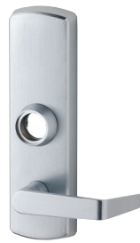
Escutcheon lever - Night latch