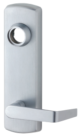
Escutcheon lever - Classroom

1 Mortise cylinder with standard cam similar to Schlage B502-191 cam