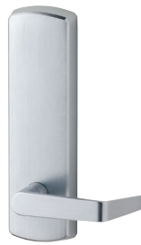
Escutcheon lever - Passage blank escutcheon